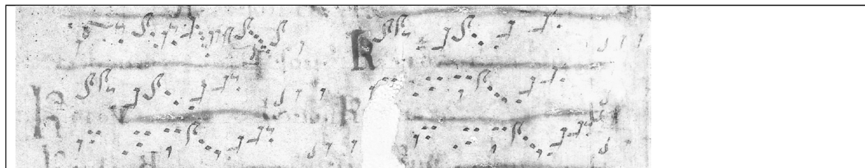
lat. 10756, f. 71v